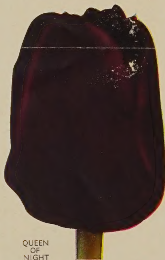
QUEEN OF NIGHT